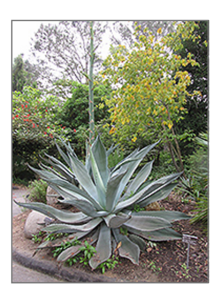
Pachycentra Agave