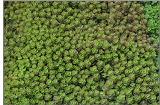
Dragon's Blood Stonecrop foliage