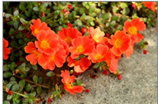
RioGrande Orange Portulaca flowers

RioGrande Orange Portulaca is recommended for the following landscape applications;