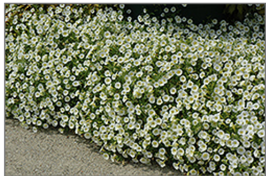
Baby Duck Yellow Petunia in bloom