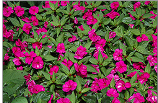
Big Bounce Violet Impatiens in bloom