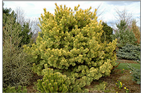
Golden Scotch Pine