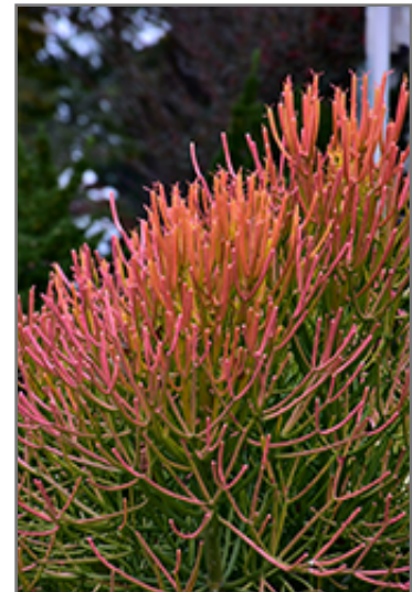
Sticks On Fire Red Pencil Tree foliage

Sticks On Fire Red Pencil Tree is recommended for the following landscape applications;