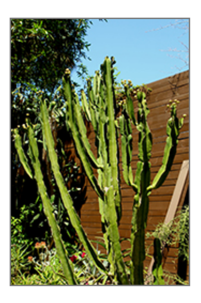
Candelabra Tree