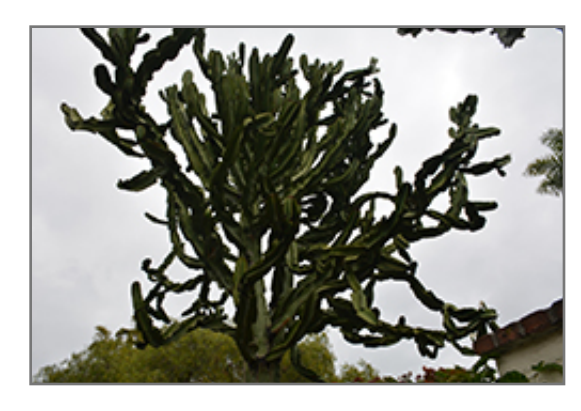
Candelabra Tree

This tree does best in full sun to partial shade. It prefers dry to average moisture levels with very well-drained soil, and will often die in standing water. It is considered to be drought-tolerant, and thus makes an ideal choice for xeriscaping or the moisture-conserving landscape. It is not particular as to soil pH, but grows best in sandy soils. It is highly tolerant of urban pollution and will even thrive in inner city environments. This species is not originally from North America, and parts of it are known to be toxic to humans and animals, so care should be exercised in planting it around children and pets.