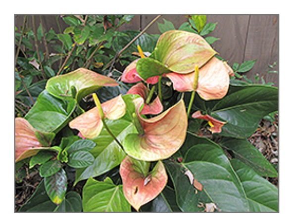
Saturn Anthurium flowers