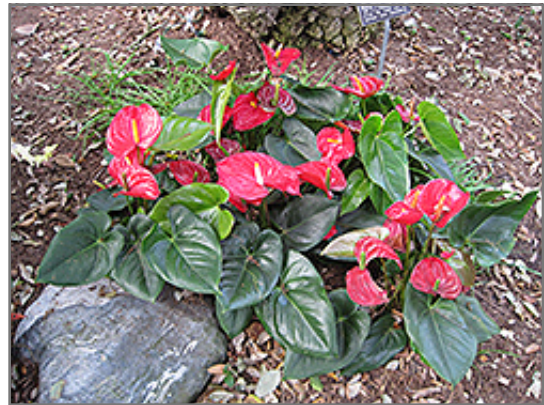
Anthurium flowers

Anthurium is recommended for the following landscape applications;