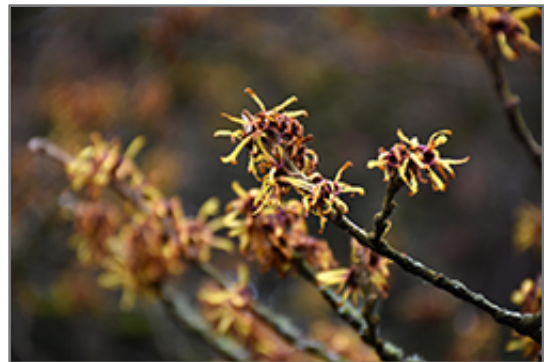
Chinese Witchhazel flowers