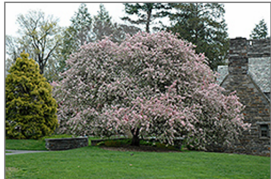
Japanese Flowering Crab in bloom