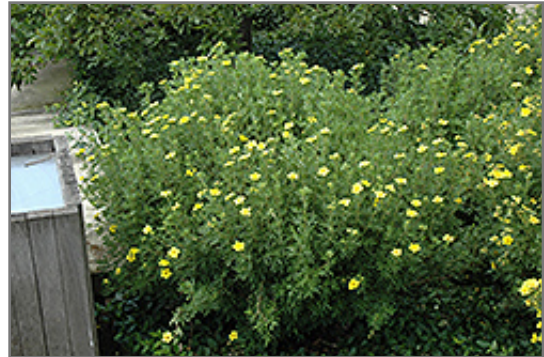
Fredheim Potentilla in bloom