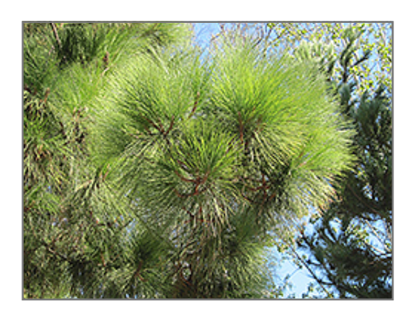
Chir Pine foliage

Chir Pine will grow to be about 80 feet tall at maturity, with a spread of 50 feet. It has a high canopy of foliage that sits well above the ground, and should not be planted underneath power lines. As it matures, the lower branches of this tree can be strategically removed to create a high enough canopy to support unobstructed human traffic underneath. It grows at a medium rate, and under ideal conditions can be expected to live to a ripe old age of 100 years or more; think of this as a heritage tree for future generations!