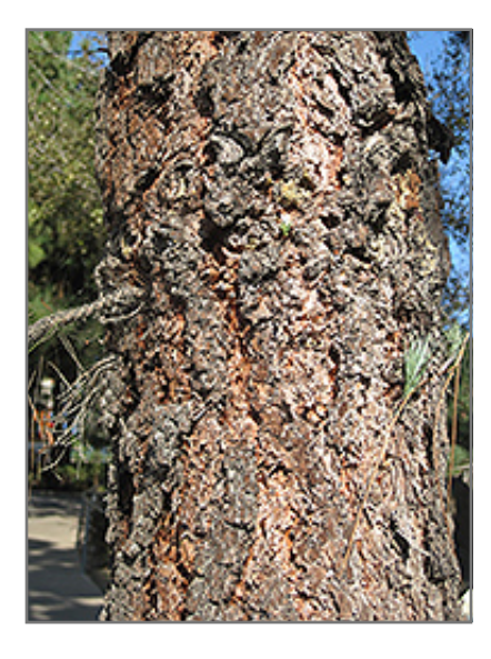
Chir Pine bark