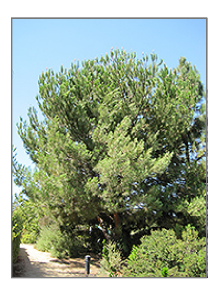
Stone Pine