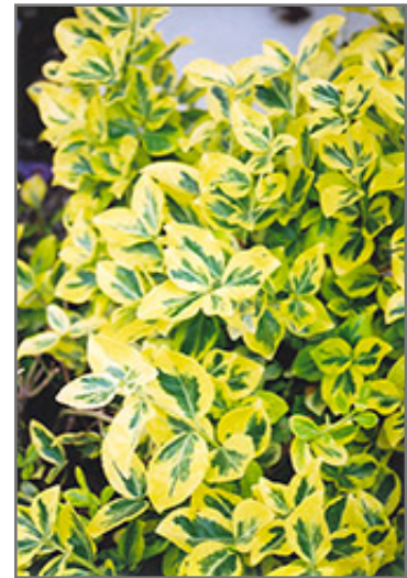
Sungold Wintercreeper foliage