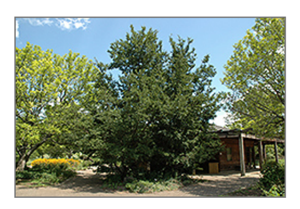
Yatsubusa Elm