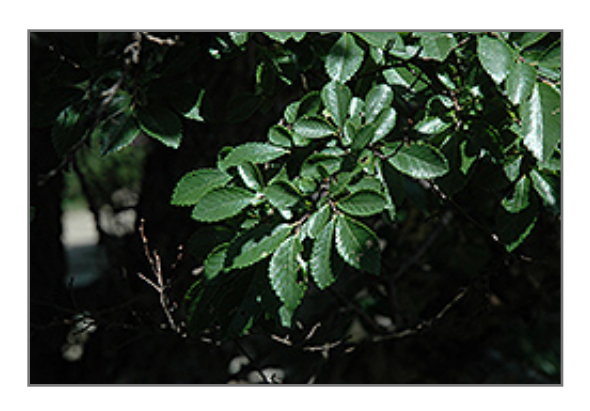
Yatsubusa Elm foliage