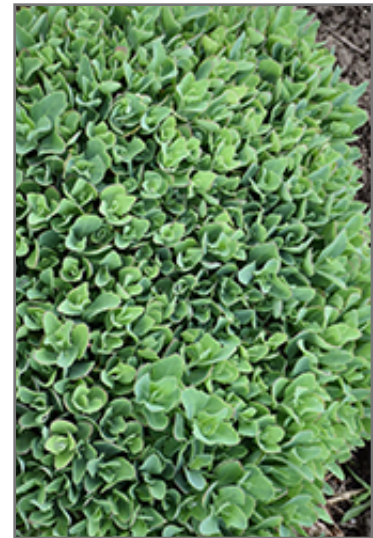
Carl Stonecrop foliage

Carl Stonecrop is a fine choice for the garden, but it is also a good selection for planting in outdoor pots and containers. It is often used as a 'filler' in the 'spiller-thriller-filler' container combination, providing a mass of flowers and foliage against which the larger thriller plants stand out. Note that when growing plants in outdoor containers and baskets, they may require more frequent waterings than they would in the yard or garden.