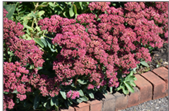
Carl Stonecrop in bloom

This is a relatively low maintenance plant, and is best cleaned up in early spring before it resumes active growth for the season. It is a good choice for attracting bees and butterflies to your yard, but is not particularly attractive to deer who tend to leave it alone in favor of tastier treats. It has no significant negative characteristics.