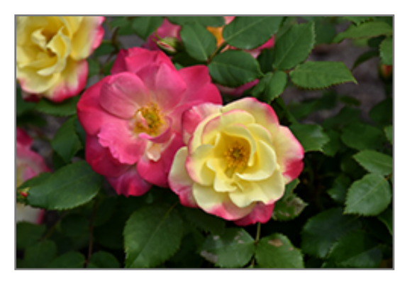
Campfire Rose flowers