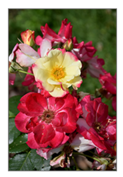
Campfire Rose flowers