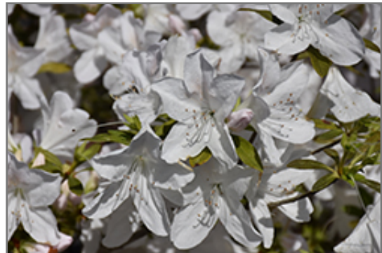
Mrs G.G. Gerbing Azalea flowers