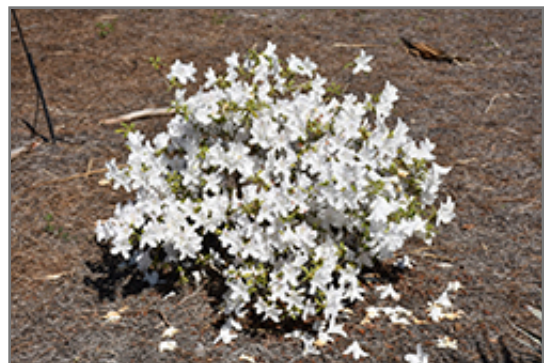
Mrs G.G. Gerbing Azalea in bloom