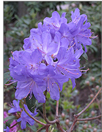
Blue Baron Rhododendron flowers