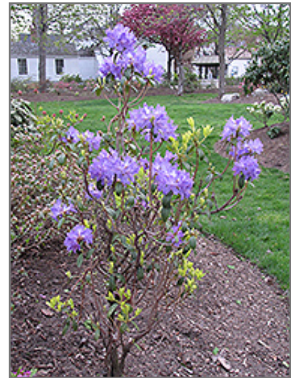
Blue Baron Rhododendron in bloom

This shrub does best in a location that gets morning sunlight but is shaded from the hot afternoon sun, although it will also grow in partial shade. Keep it away from hot, dry locations that receive direct afternoon sun or which get reflected sunlight, such as against the south side of a white wall. It requires an evenly moist well-drained soil for optimal growth, but will die in standing water. It may require supplemental watering during periods of drought or extended heat. It is very fussy about its soil conditions and must have rich, acidic soils to ensure success, and is subject to chlorosis (yellowing) of the foliage in alkaline soils. It is somewhat tolerant of urban pollution, and will benefit from being planted in a relatively sheltered location. Consider applying a thick mulch around the root zone in winter to protect it in exposed locations or colder microclimates. This particular variety is an interspecific hybrid.