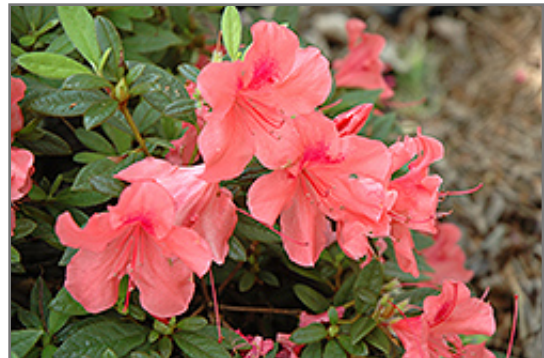
Encore Autumn Coral Azalea flowers

Encore Autumn Coral Azalea will grow to be about 3 feet tall at maturity, with a spread of 4 feet. It tends to be a little leggy, with a typical clearance of 1 foot from the ground. It grows at a slow rate, and under ideal conditions can be expected to live for 40 years or more.