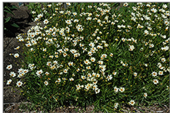
Star Cluster Tickseed in bloom