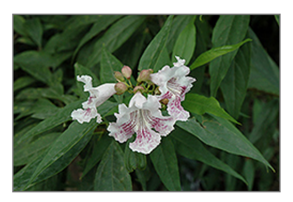
Morning Cloud Chitalpa flowers

Morning Cloud Chitalpa will grow to be about 30 feet tall at maturity, with a spread of 25 feet. It has a low canopy with a typical clearance of 2 feet from the ground, and should not be planted underneath power lines. It grows at a fast rate, and under ideal conditions can be expected to live for 50 years or more.