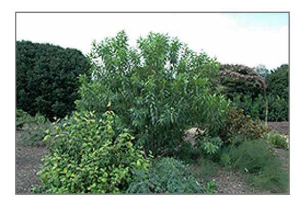
Morning Cloud Chitalpa