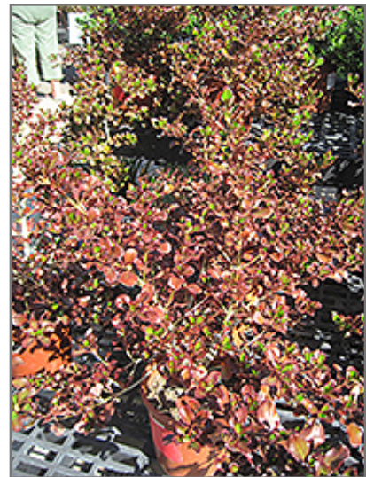
Plum Hussey Mirror Bush