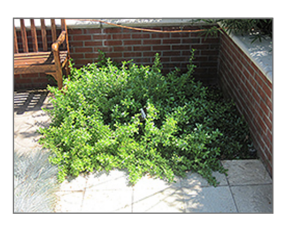
Creeping Mirror Bush