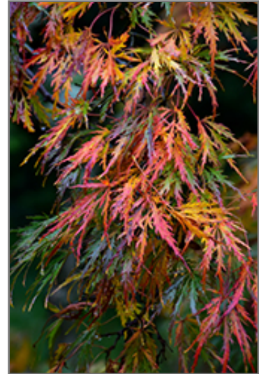
Cutleaf Japanese Maple in fall

Cutleaf Japanese Maple makes a fine choice for the outdoor landscape, but it is also well-suited for use in outdoor pots and containers. Because of its height, it is often used as a 'thriller' in the 'spiller-thriller-filler' container combination; plant it near the center of the pot, surrounded by smaller plants and those that spill over the edges. It is even sizeable enough that it can be grown alone in a suitable container. Note that when grown in a container, it may not perform exactly as indicated on the tag - this is to be expected. Also note that when growing plants in outdoor containers and baskets, they may require more frequent waterings than they would in the yard or garden.