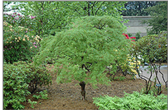
Cutleaf Japanese Maple