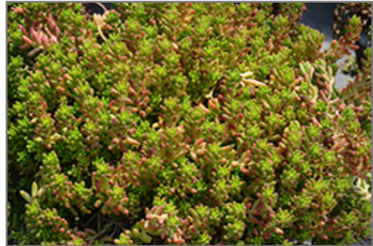
Jelly Bean Plant