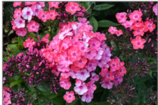
Garden Girls Glamour Girl Garden Phlox flowers

Garden Girls Glamour Girl Garden Phlox is recommended for the following landscape applications;