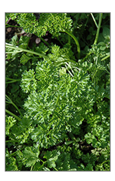
Forest Green Parsley foliage