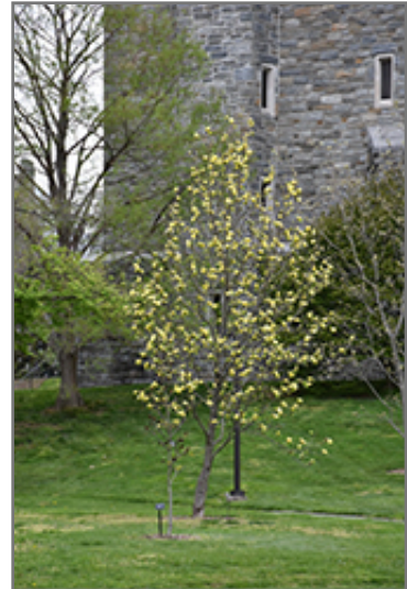
Green Bee Magnolia in bloom