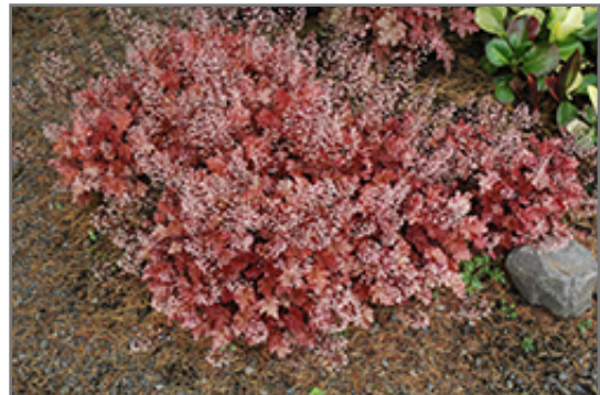
Peach Crisp Coral Bells in bloom

Peach Crisp Coral Bells is recommended for the following landscape applications;