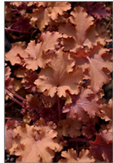
Peach Crisp Coral Bells foliage

Peach Crisp Coral Bells will grow to be about 14 inches tall at maturity extending to 20 inches tall with the flowers, with a spread of 18 inches. When grown in masses or used as a bedding plant, individual plants should be spaced approximately 15 inches apart. Its foliage tends to remain dense right to the ground, not requiring facer plants in front. It grows at a medium rate, and under ideal conditions can be expected to live for approximately 10 years. As an evergreen perennial, this plant will typically keep its form and foliage year-round.