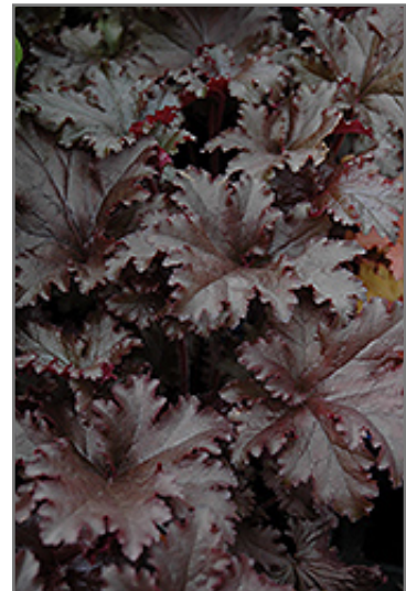
Black Taffeta Coral Bells foliage

Black Taffeta Coral Bells is recommended for the following landscape applications;