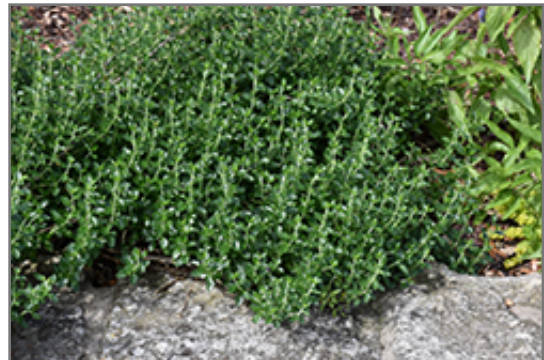
Small Coastal Germander