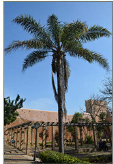
Queen Palm

Queen Palm is recommended for the following landscape applications;