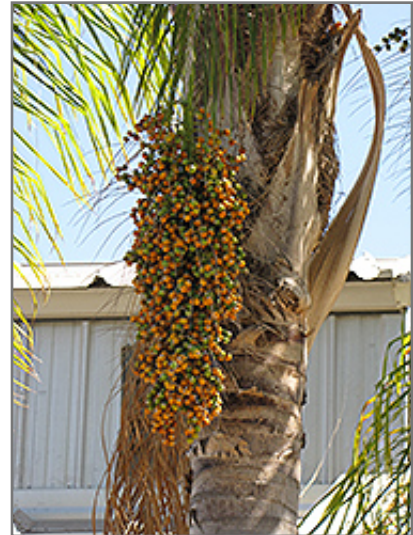
Queen Palm fruit