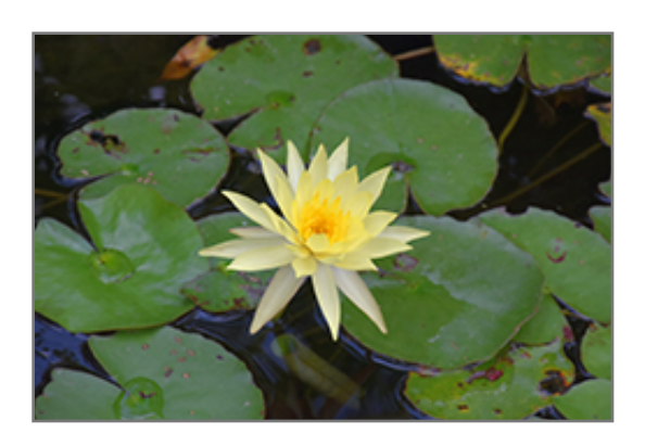
Yellow Water Lily flowers