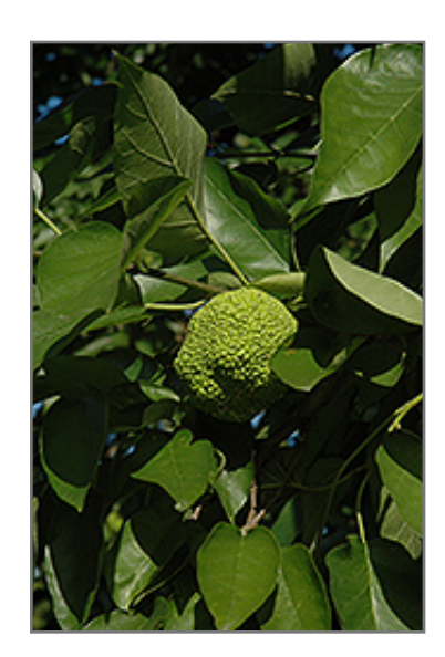
Osage Orange fruit