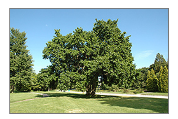
Osage Orange