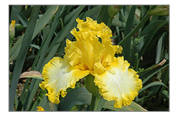
That's All Folks Iris flowers