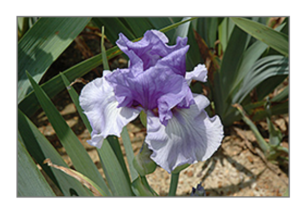
Poet's Rhyme Iris flowers