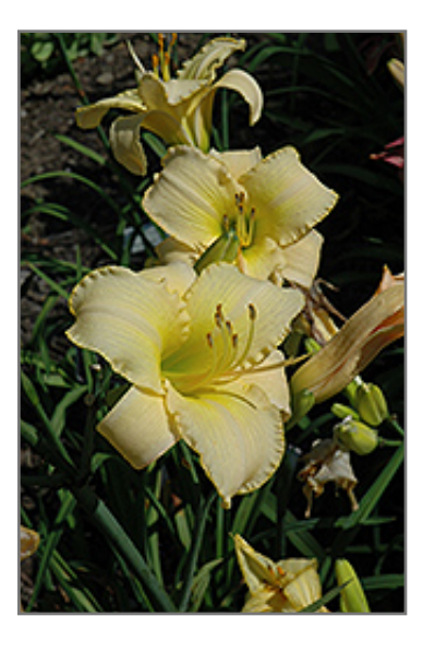
Solar Crest Daylily flowers