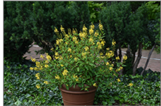
Thryallis in bloom