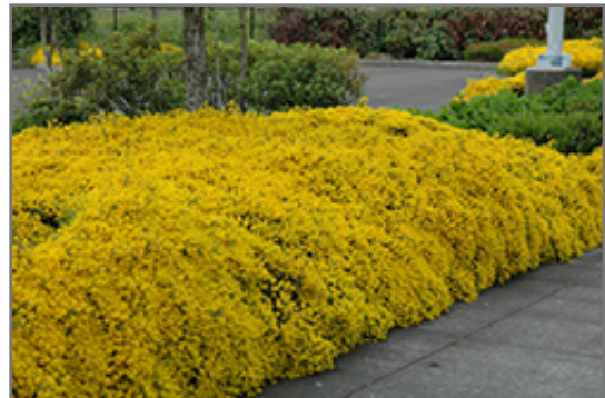
Lydia Woadwaxen in bloom