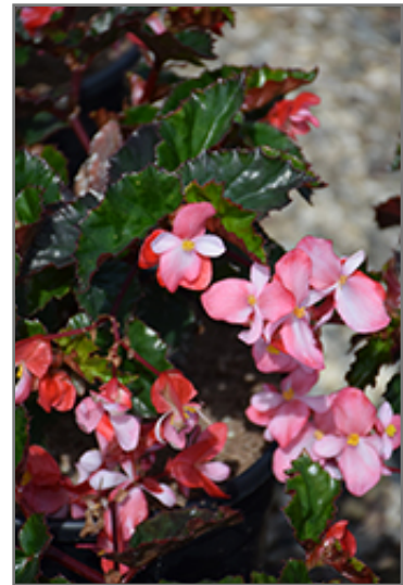
Richmond Begonia flowers

Richmond Begonia is recommended for the following landscape applications;