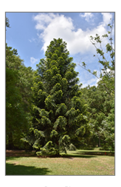
Bunya Pine