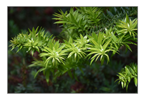
Bunya Pine foliage