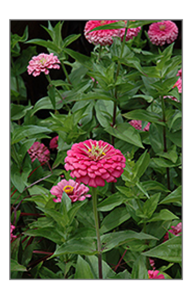
Miss Willmott Zinnia flowers

Miss Willmott Zinnia will grow to be about 32 inches tall at maturity, with a spread of 24 inches. When grown in masses or used as a bedding plant, individual plants should be spaced approximately 18 inches apart. Its foliage tends to remain dense right to the ground, not requiring facer plants in front. This fast-growing annual will normally live for one full growing season, needing replacement the following year.