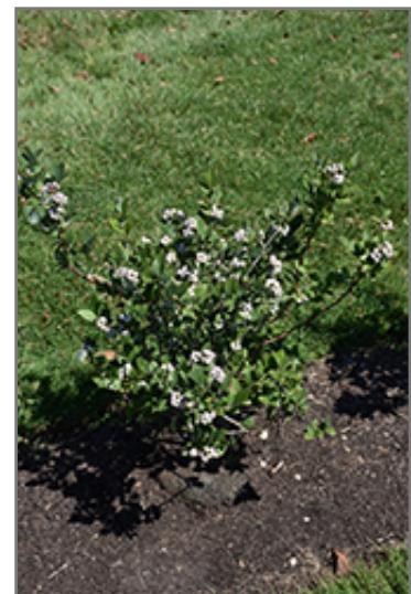
Elliott Blueberry fruit