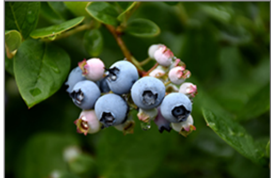
Elliott Blueberry fruit

Elliott Blueberry features dainty clusters of white bell-shaped flowers with shell pink overtones hanging below the branches in mid spring. It has green deciduous foliage. The glossy oval leaves turn yellow in fall. It features an abundance of magnificent blue berries from late summer to early fall. The smooth brick red bark adds an interesting dimension to the landscape.