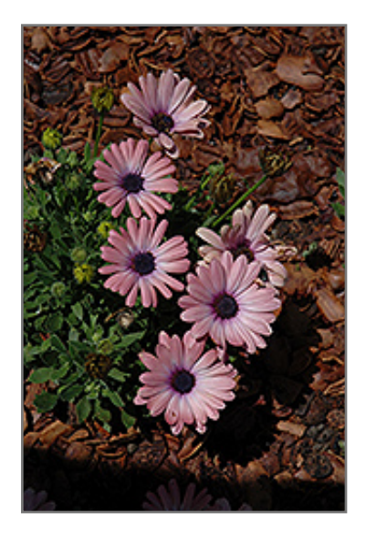
Fortunette Dusky Rose African Daisy flowers