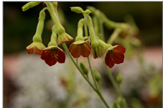
Tinkerbell Flowering Tobacco flowers

Tinkerbell Flowering Tobacco is recommended for the following landscape applications;