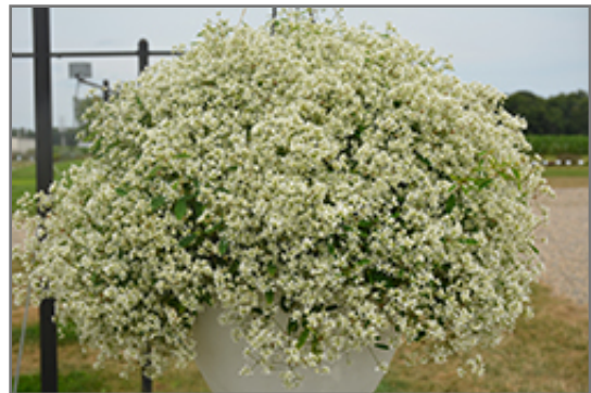
Stardust Super Flash Euphorbia in bloom