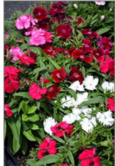
Floral Lace Mix Pinks flowers